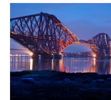
'Building bridges within the communities of Fife'